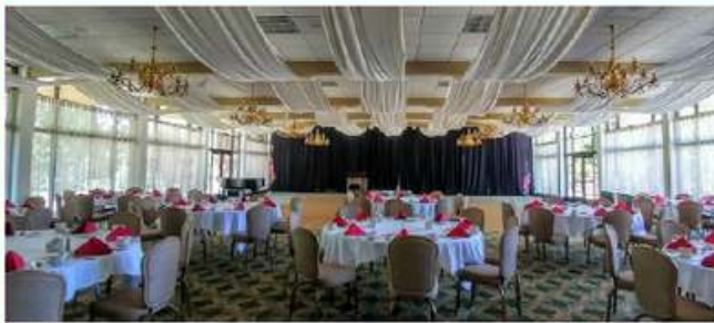
North Ridge Country Club, 7600 Madison Ave. Fair Oaks