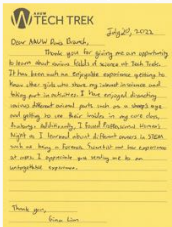
Notes from Regina Lim