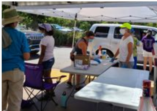
COVID-19 testing station as campers arrive with their families on the first day of Tech Trek at UC Davis.

During the week, campers also took tours of on-campus facilities such as the Veterinary School and the Mondavi Arts