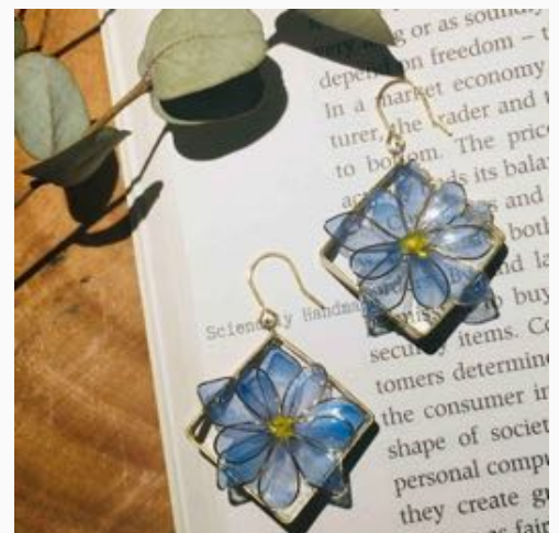
An example of Annie's beautiful jewelry